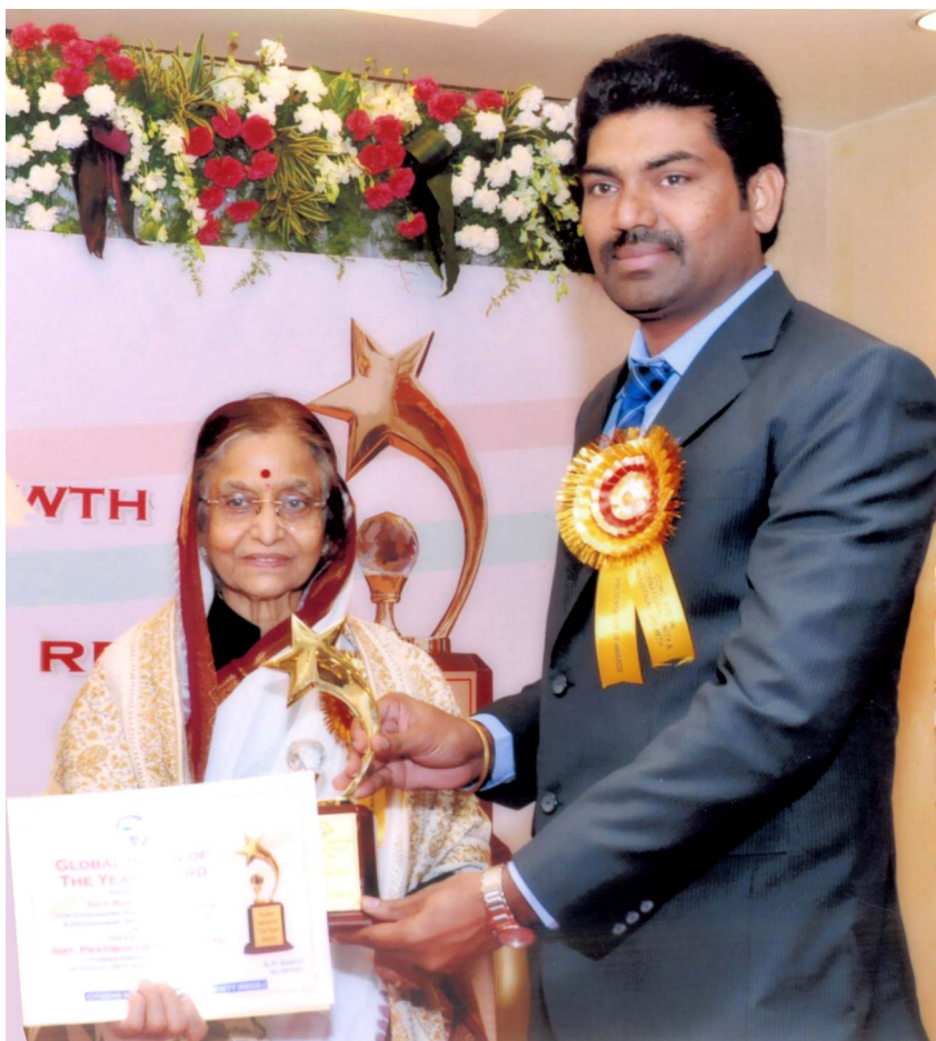
Educational Award Received From Former President of India Smt. Prathibha Patil